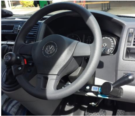
Guidosimplex radial accelerator / brake lever