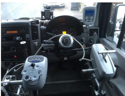
Electric gas & brake with electric mini wheel steering