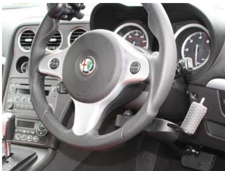
Gosling push/pull hand controls & steering ball