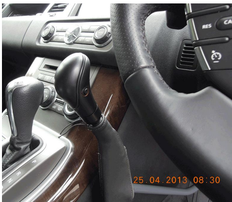
AutoAdapt Carospeed floor mounted hand control