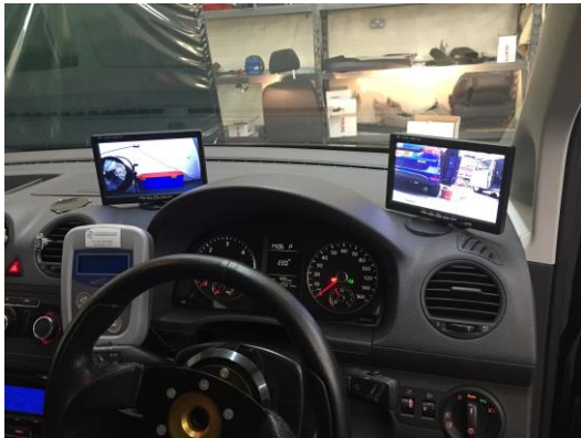
Junction view/blind spot cameras