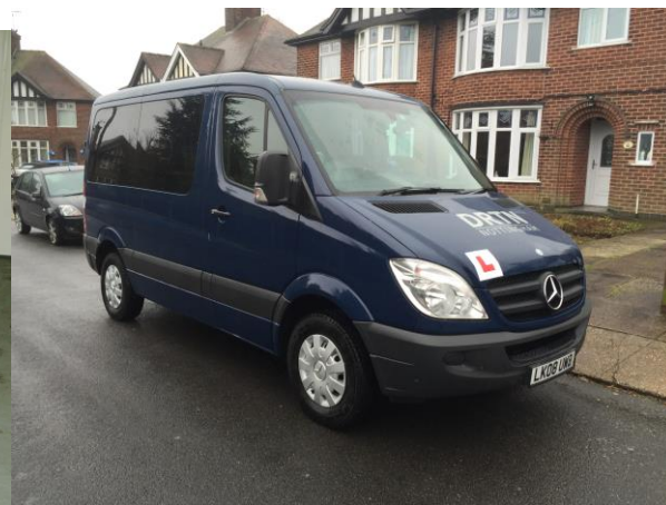
Mercedes Benz Sprinter