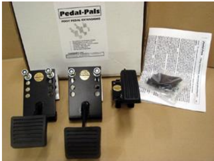
Pedal Pals extension pedals

If you are young, disabled and keen to get behind the wheel for the first time, or newly disabled and want to research the variety of different adapted driving controls that will help you get back behind the wheel, Get Going Live! is the event for you.