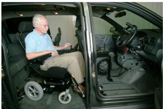
Drive from wheelchair