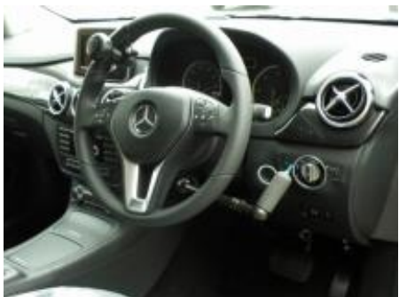
Brig Ayd push/pull hand controls & steering ball