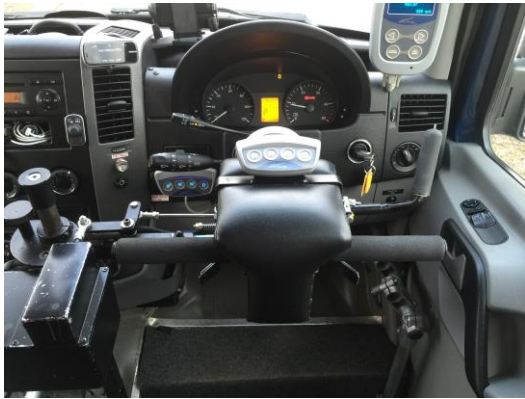
Tiller steering with electric gas & brake