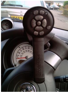
Lodgeson lollipop grip with integral secondary controls