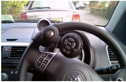
Lodgeson steering ball mounted secondary controls