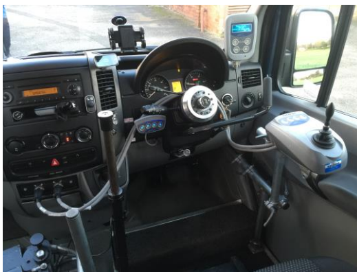
4-way joystick (steering, accelerating & braking)