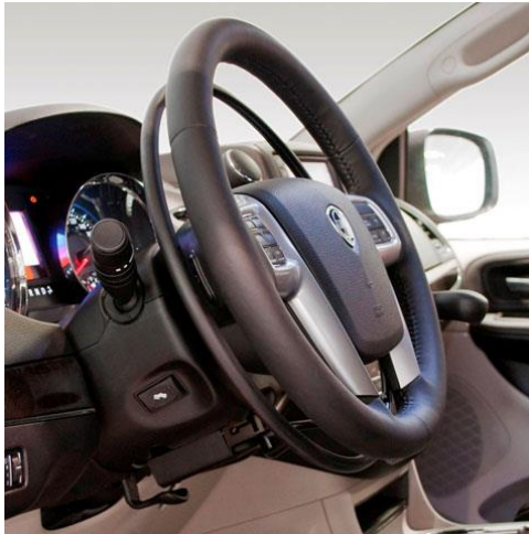
AutoAdapt K5 under ring accelerator & brake lever