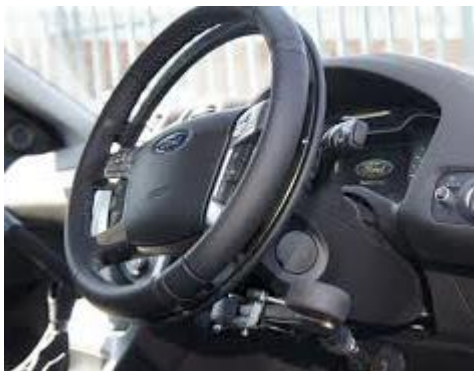
Guidosimplex Ghost – rotating under ring accelerator