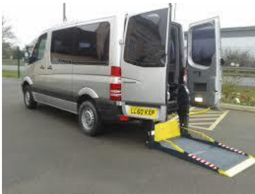
Mercedes Benz Sprinter