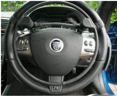
Guidosimplex over ring accelerator & brake lever