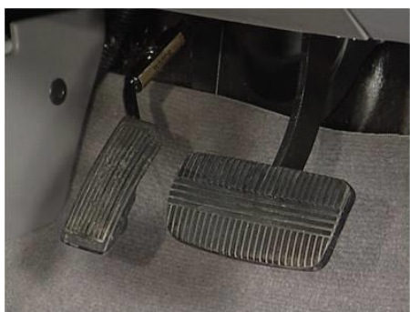
Left foot accelerator (twin flip pedals)