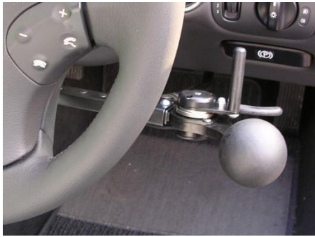
Brig Ayd trigger accelerator / brake lever